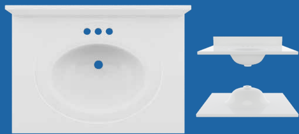
Size 25x19,31x19,31x22,37x22,... (Customized) Basin shape: Oval | Color: Pure White