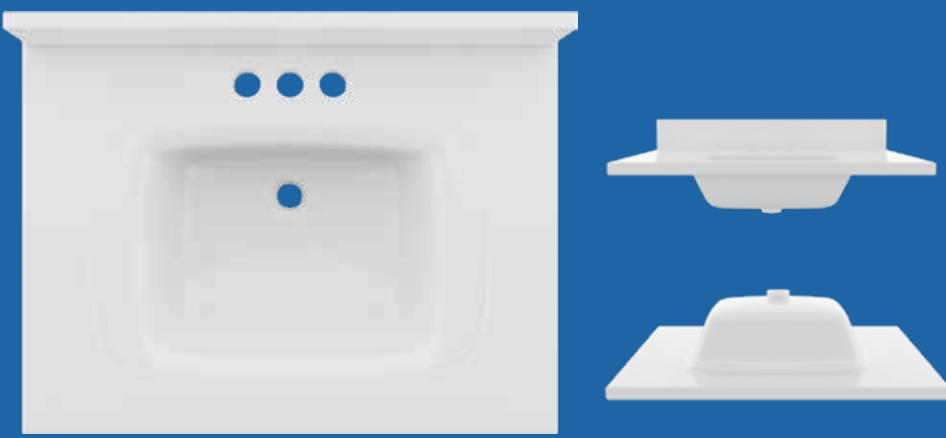
Size 25x19,31x19,31x22,37x22,... (Customized) Basin shape: square | Color: Pure White